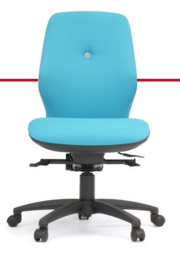
B100 BACKREST S100 SEAT