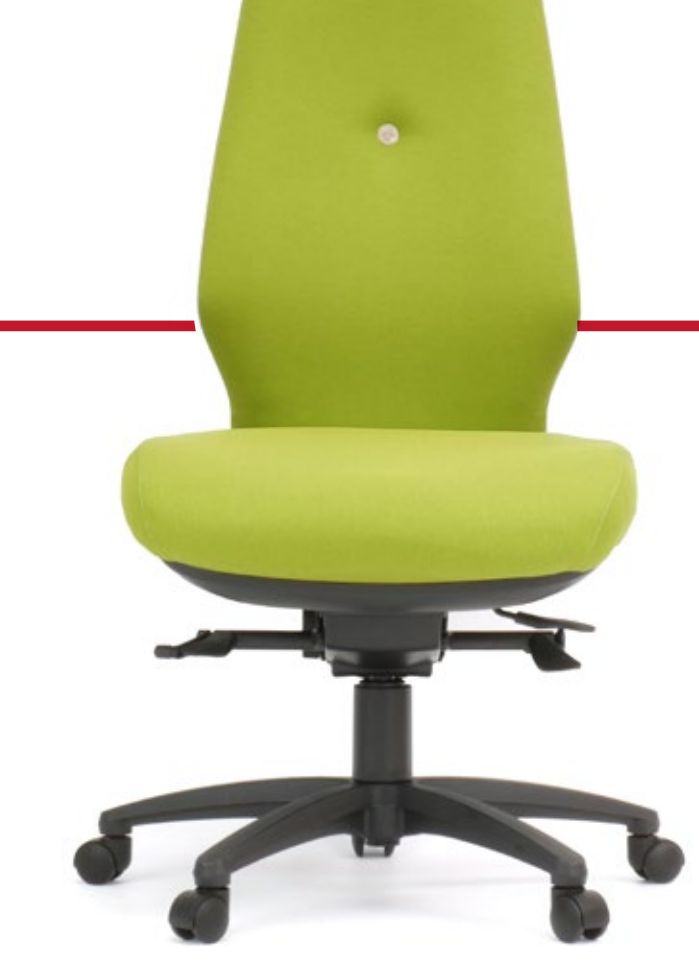
B400 BACKREST S400 SEAT