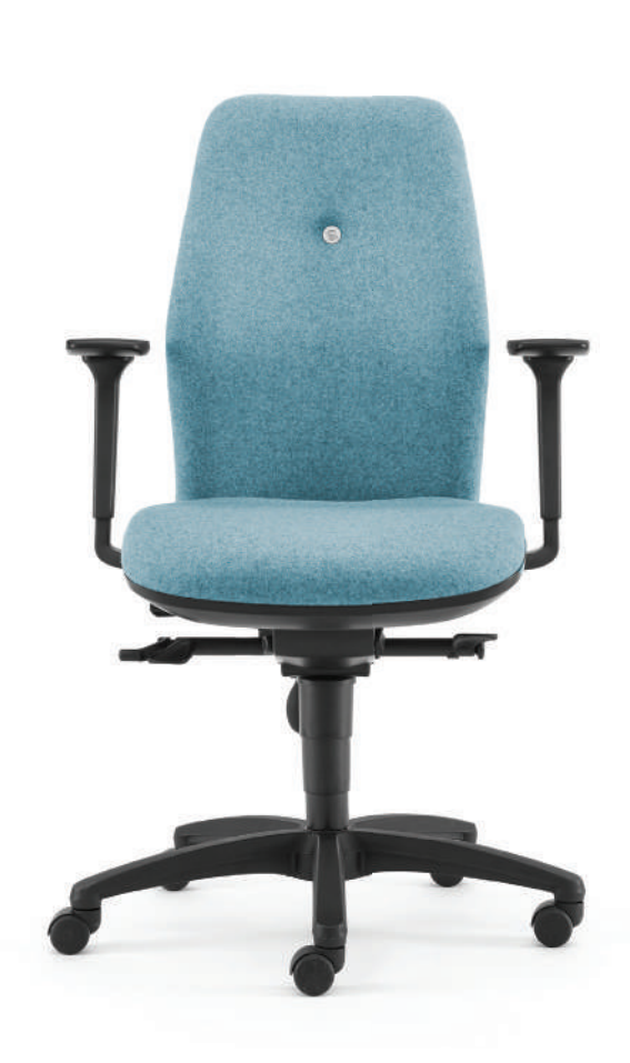
B200 BACKREST S300 SEAT