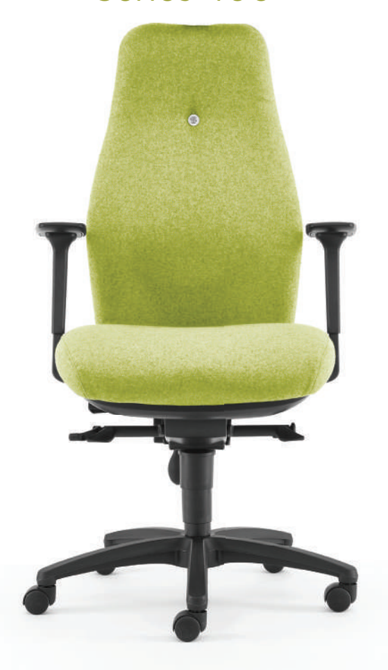
B400 BACKREST S400 SEAT