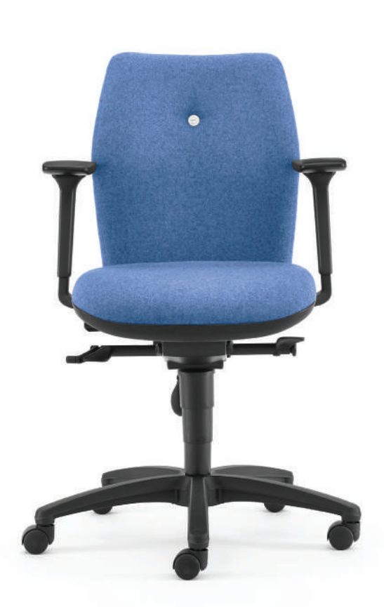
B100 BACKREST S100 SEAT