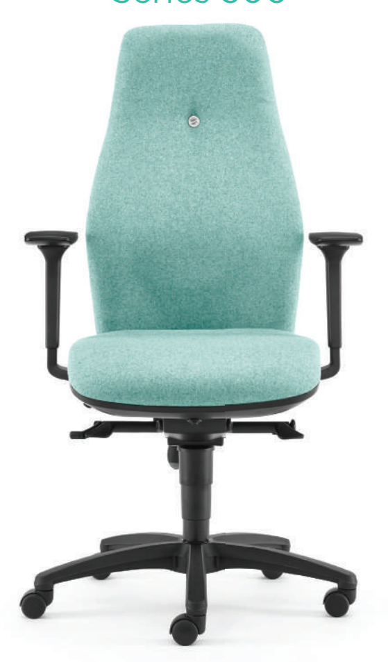
B300 BACKREST S300 SEAT